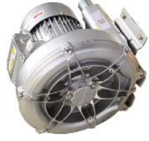
Cooling blower TB 0080

Silencer TB 0080-SI (Noise reduction up to 5 dB(A)) Dimensions (LxD): 310 x 65 mm Weight: 0.2 kg Acoustic enclosure TB 0080-AE (Noise reduction 15 - 23 dB(A)) Dimensions (WxHxD): 795 x 841 x 699 mm Weight: 45 kg Hose length according to customers request (up to 10 m)