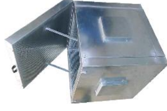
Acoustic enclosure TB 0080-AE (optional)