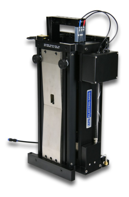
APS 113-AB with APS 0162 Vertical Mounting Kit

Modes of operation requiring high bearing loads (table mode and APS 0112 - Reaction Mass mode), permissible with the standard linear ball bushing